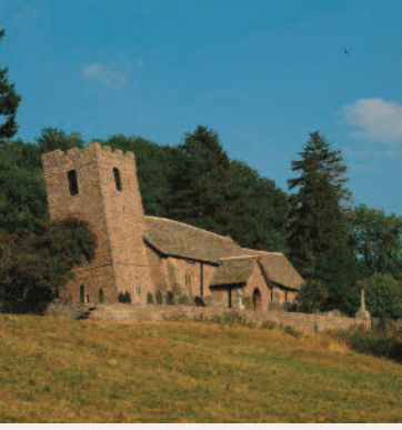
Above: Patrishow, Cymyoy. Right: Capel-y-ffin, St Faiths Church Llanfoist.